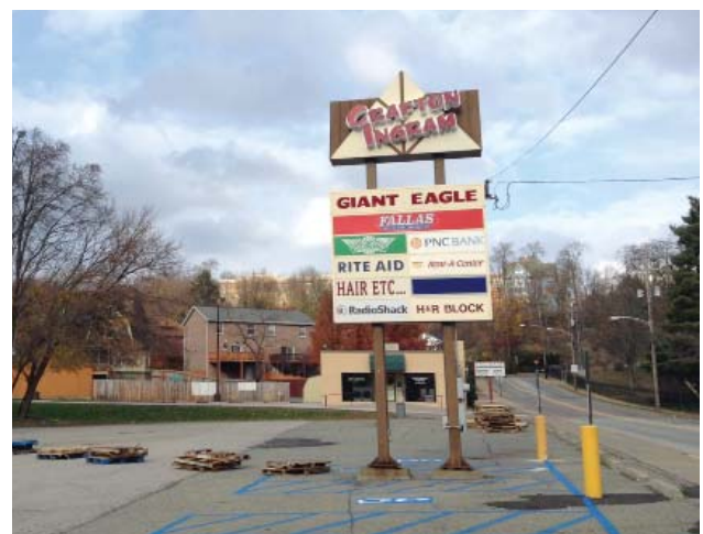
Chapter 2: Commercial Development