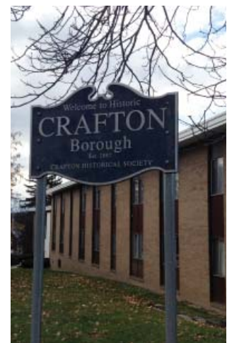
Chapter 3: Communications