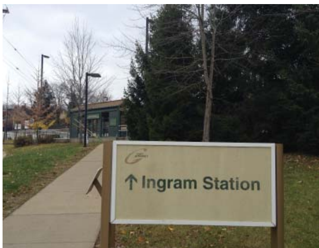
Chapter 3: Walkability + Connectivity