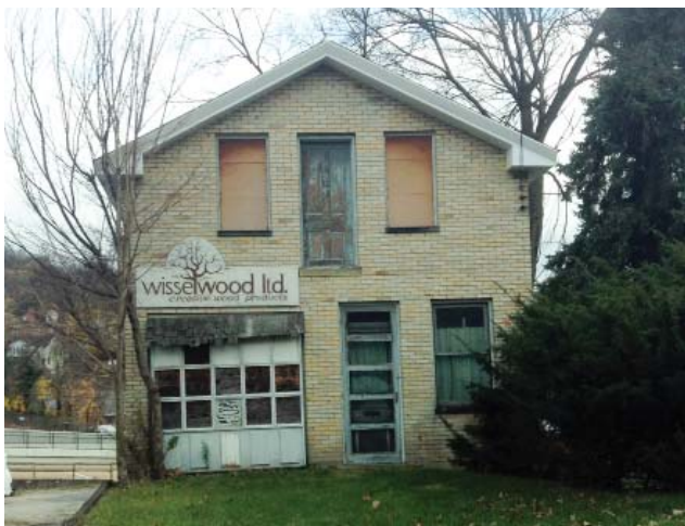
Chapter 1: Deteriorating Properties

The boroughs chose four working areas as the primary focus of the implementable plan. Work to make positive changes is already under way.