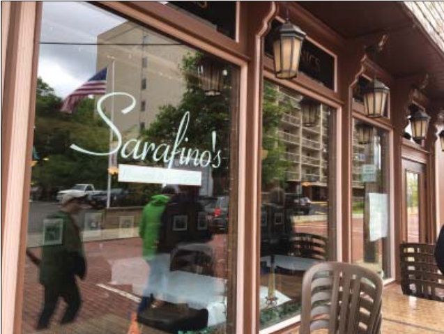
On a walking tour of the boroughs, members of the steering committee pass a popular local restaurant.