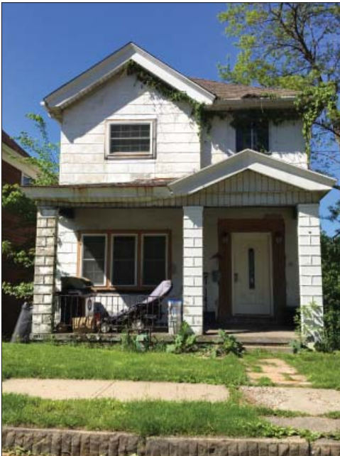
The presence of poorly maintained properties harms the value of other homes or buildings in the area.